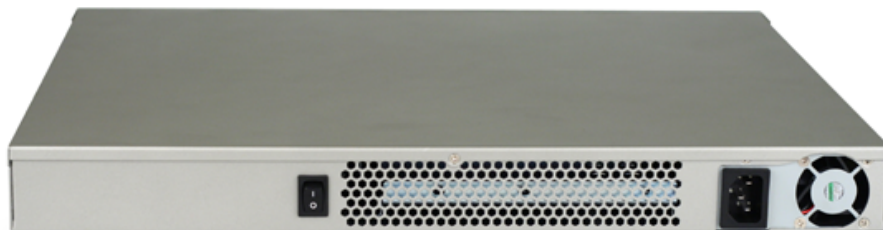
Figure 2.1. SG3200 Rear View

This section describes connecting power to the SG3200. Power should not actually be switched on using the On/Off switch until after the local console has been connected as described in Section 3.1.2, “Connecting the Console Port”. The reason for this is that as soon as power is applied the boot-up dialog sequence will appear on the console screen.