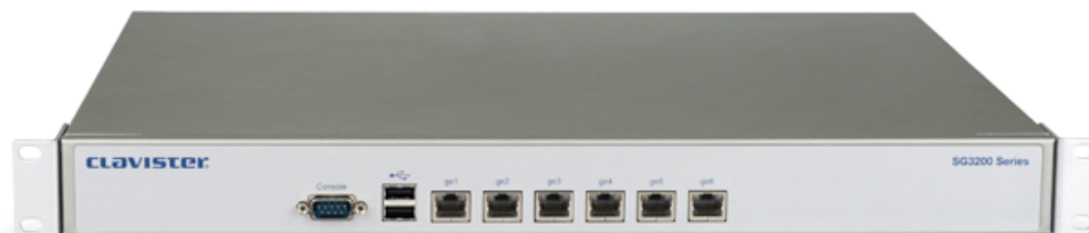
Figure 1.1. Front view of the Clavister SG3200 Series.

The SG3200 features a number of connection ports: