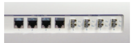
Clavister H4080B with 4 copper and 4 fiber gigabit Ethernet interfaces.

The new Clavister H-Series simply built to work to the max. Always.