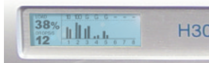
The LCD display gives an instant overview of performance and interface status.

Still, the appliances don't require more rack space than, respectively, one and two height